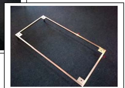
Alternative base frame