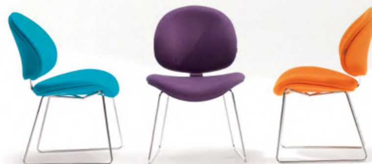
KST 2_ Medium back swivel visitors chair, upholstered in Blazer Aston. KST 1_ Medium back sled base chair with chrome frame.