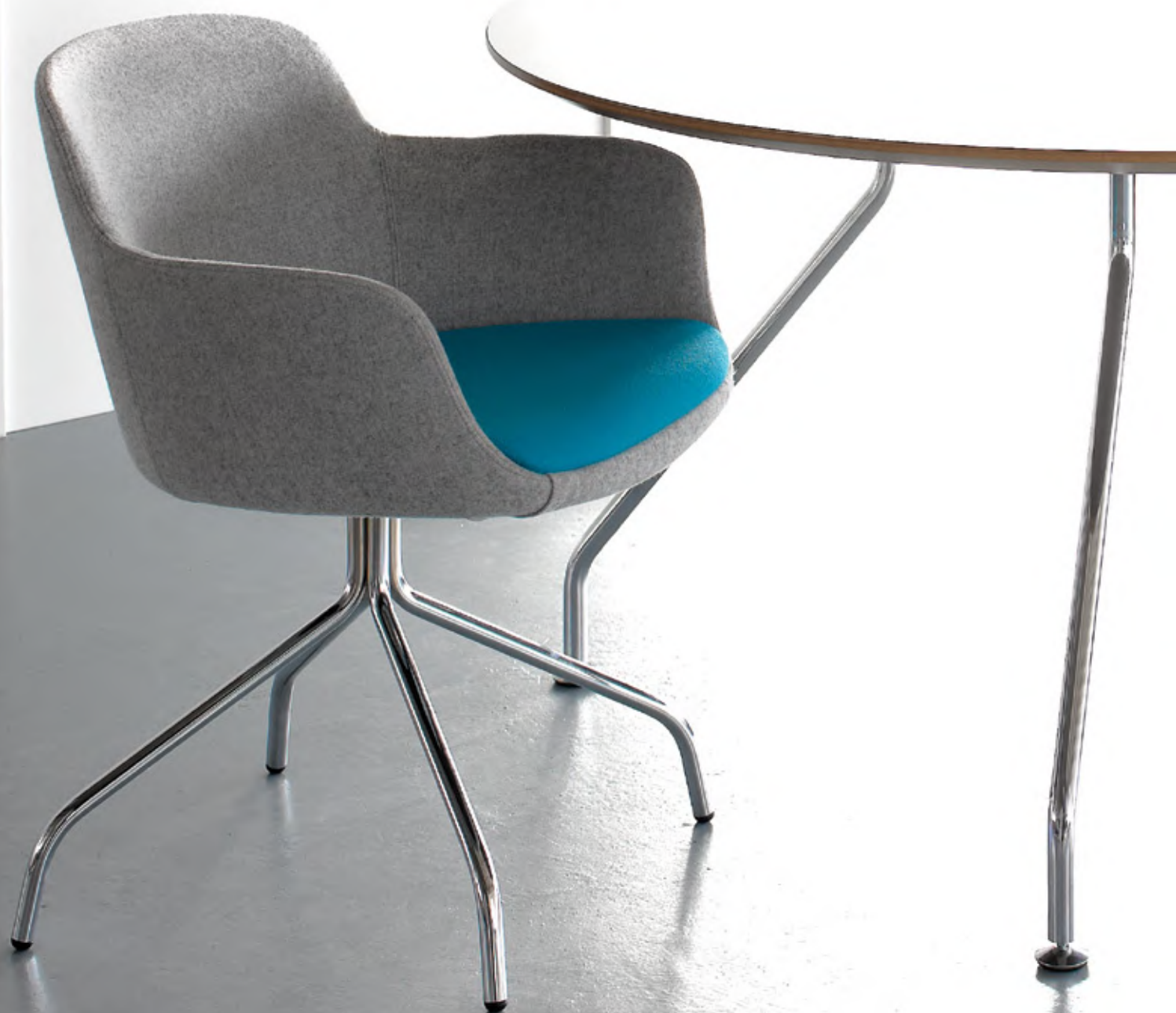
DNY 1_ Medium back tub chair with four legged chrome frame, upholstered in Blazer Aston and Silverdale.