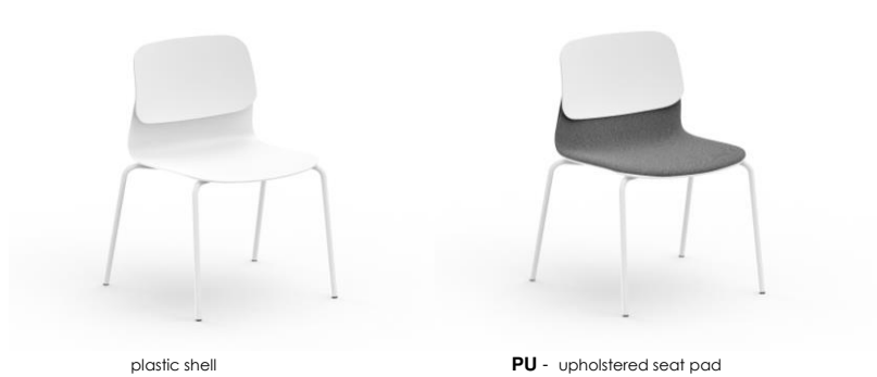
PU - upholstered seat pad plastic outer shell and back